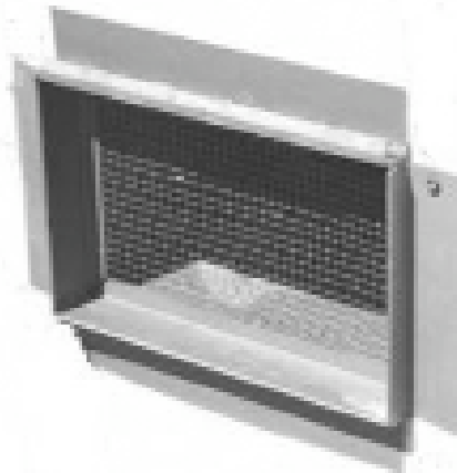
CRAWL SPACE VENT INSTALLED