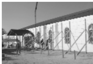
STEEL STUDS & TURNBUCKLES